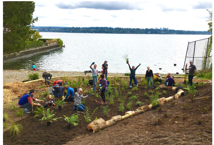
Volunteers at the E Prospect Street shoreline street end