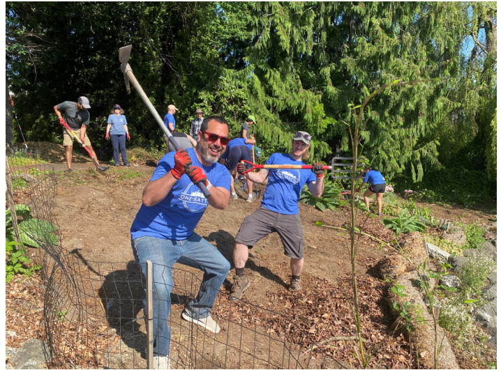
Volunteers attending the One Seattle Day of Service at our E Atlantic Street shoreline street end