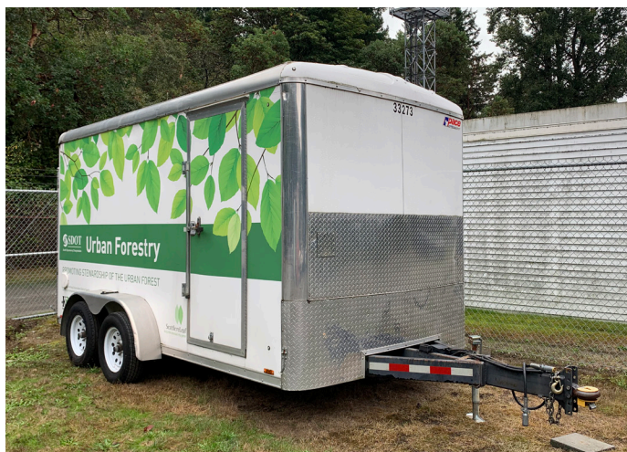
Large Tool Trailer for Volunteer Events